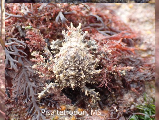
Pisa tetrodon, MS