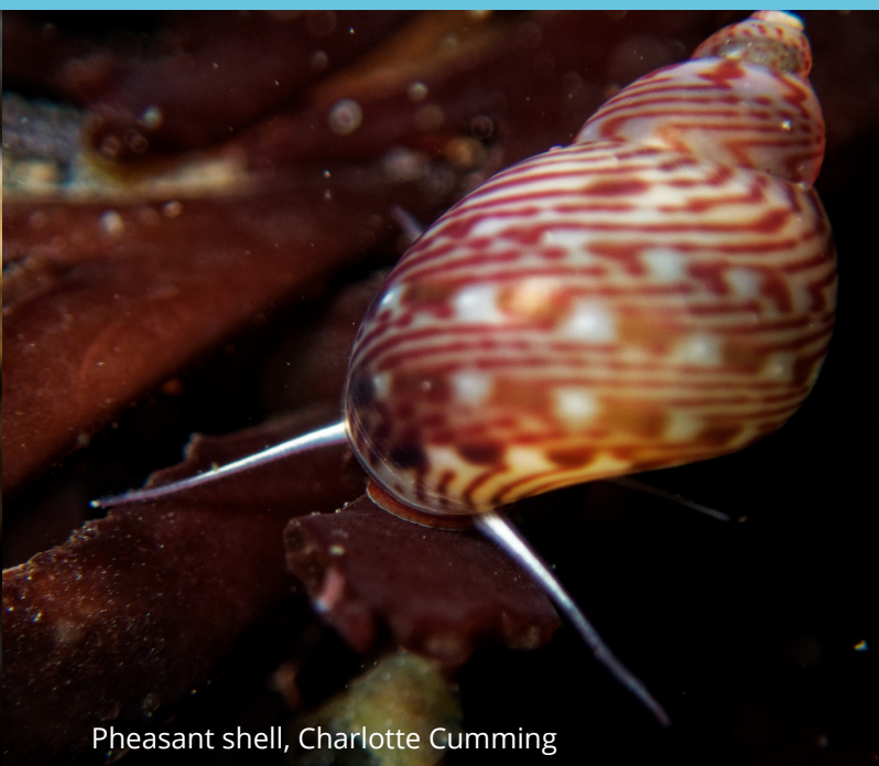
Pheasant shell, Charlotte Cumming