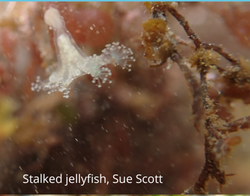
Stalked jellyfish