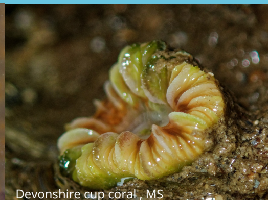
Devonshire cup coral, MS