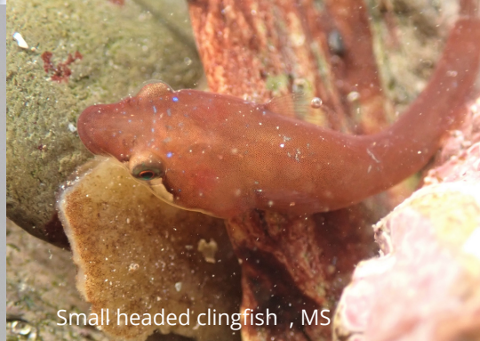
Small headed clingfish, MS