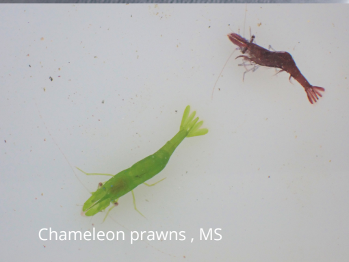
Chameleon prawns