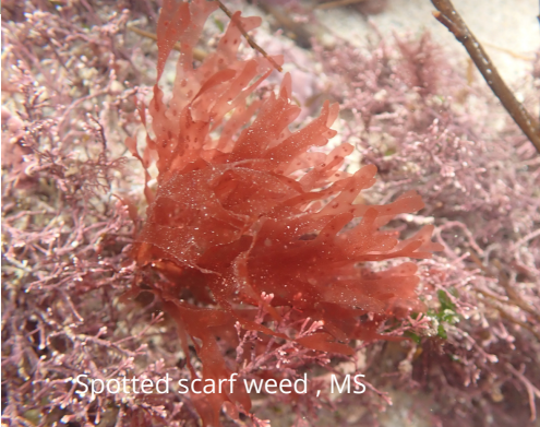
Spotted scarf weed, MS