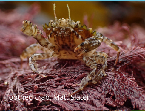
Toothed crab, Matt Slater