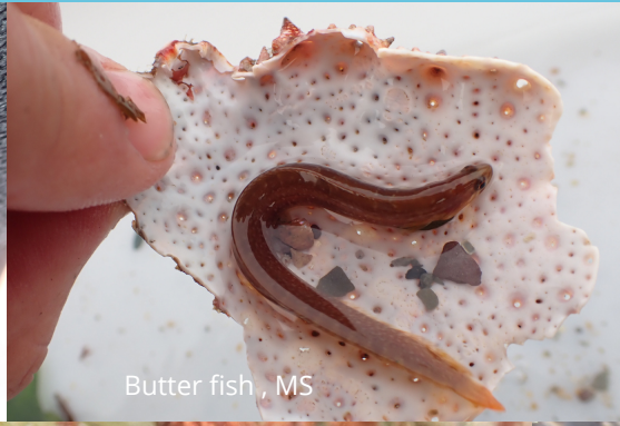
Butter fish, MS