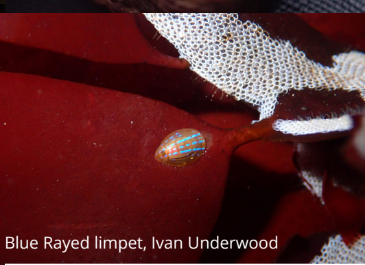
Blue Rayed limpet, Ivan Underwood