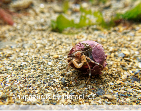
Anupagurus hyndmani, CC