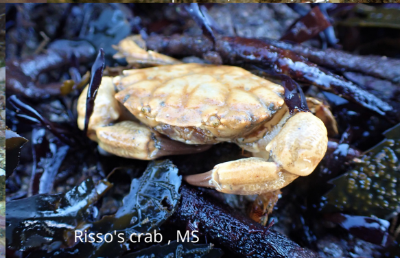
Risso's crab, MS