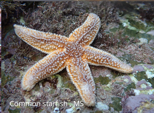
Common starfish, MS