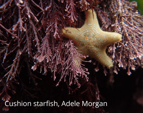
Cushion starfish