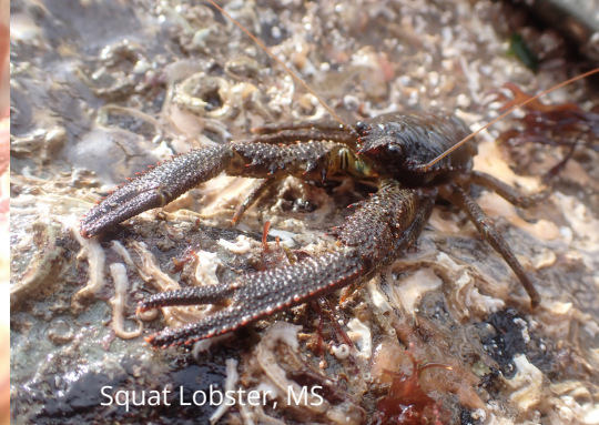
Squat Lobster, MS