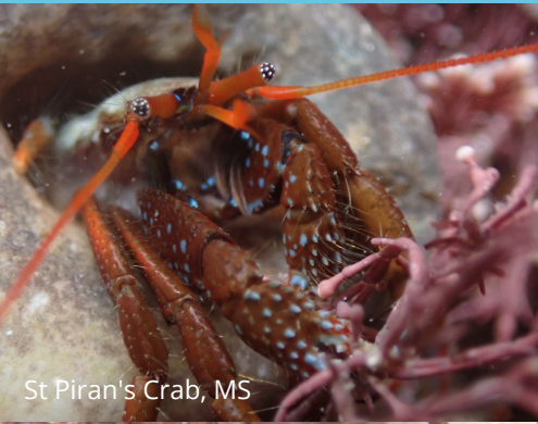
St Piran's Crab, MS