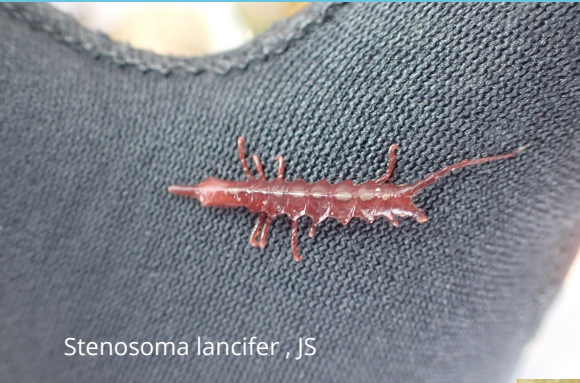
Stenosoma lancifer