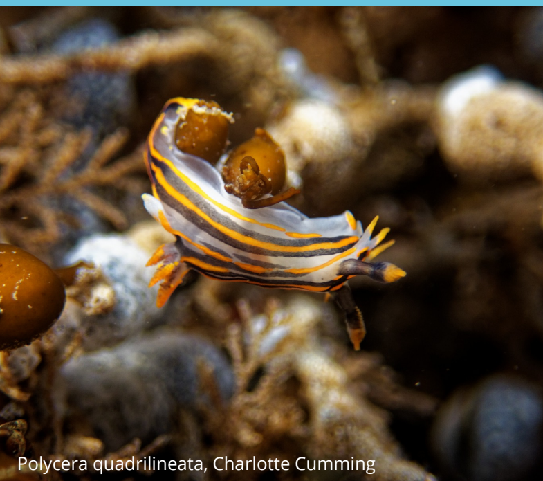
Polycera quadrilineata, Charlotte Cumming

Celebrating ten years of Shoresearch in Cornwall!