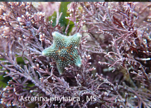
Asterina phylatica, MS