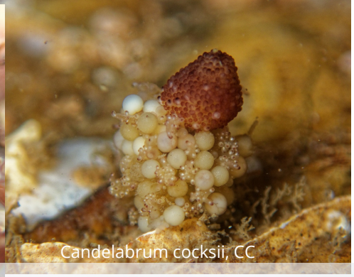
Candelabrum cocksii, CC