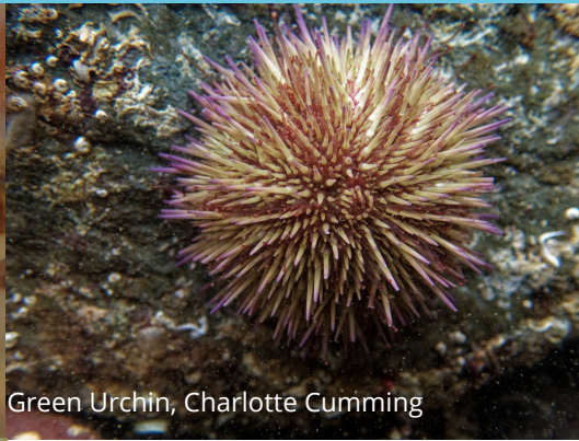
Green Urchin, Charlotte Cumming