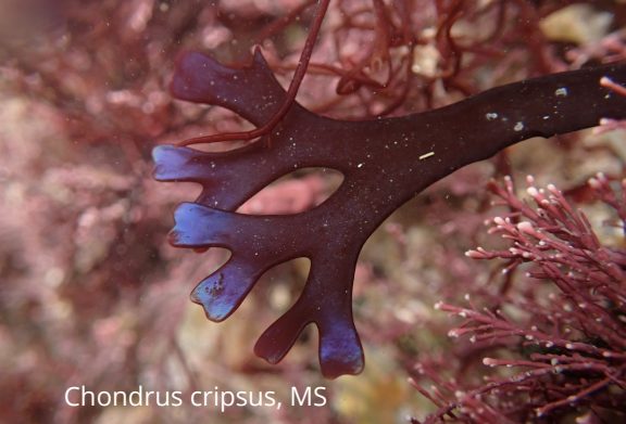
Chondrus crispus, MS