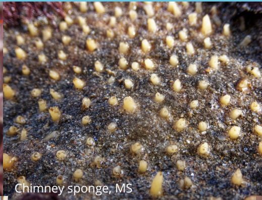
Chimney sponge, MS