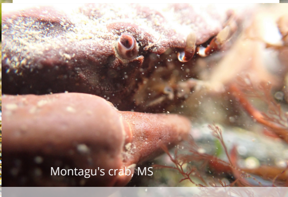
Montagu's crab, MS