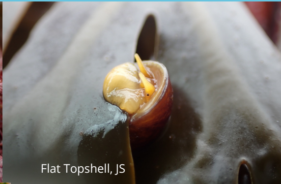
Flat Topshell, JS