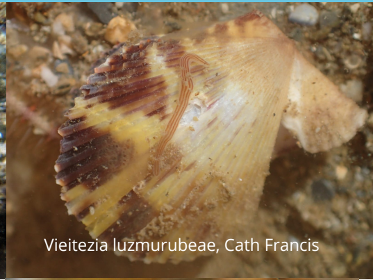
Vieitezia luzmurubeae