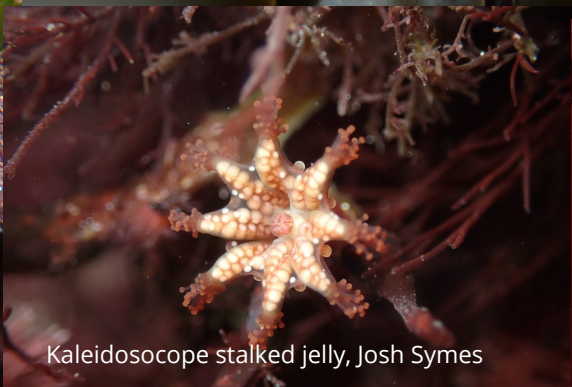
Kaleidoscope stalked jelly, Josh Symes