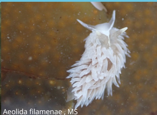
Aeolida filamenae, MS