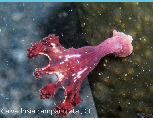
Calvadosia campanulata, CC