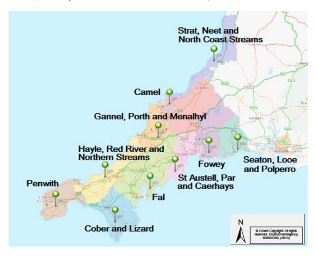
Figure 1: Map showing Operational Catchments covered by Cornwall Catchment Partnership

Both of the CCP's management catchments are largely rural in nature with tourism and farming of particular importance to the local economy. There are historic impacts to the water environment from mining but there are also current water quality issues, including but not limited to: slurry, chemicals and soil runoff associated with farming practices; risks associated with sewage; and runoff from urban areas. In 2019 only 26% of waterbodies were assessed as being at Good Ecological Status under the Water Framework Directive highlighting the need for more to be done to protect our rivers, lakes and coastal water bodies. Parts of the West Cornwall & Fal and North Cornwall, Seaton, Looe & Fowey management catchments are designated as Special Sites of Scientific Interest, European designated sites, Area of Outstanding Natural Beauty and we also have the highest proportion of designated bathing waters in England.