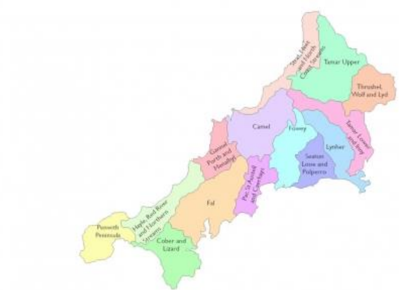
Excepting Tamar which has its own Partnership