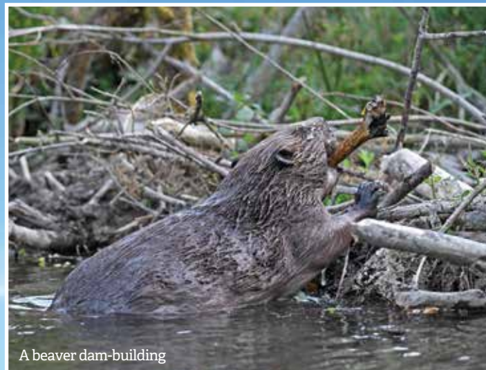
A beaver dam-building