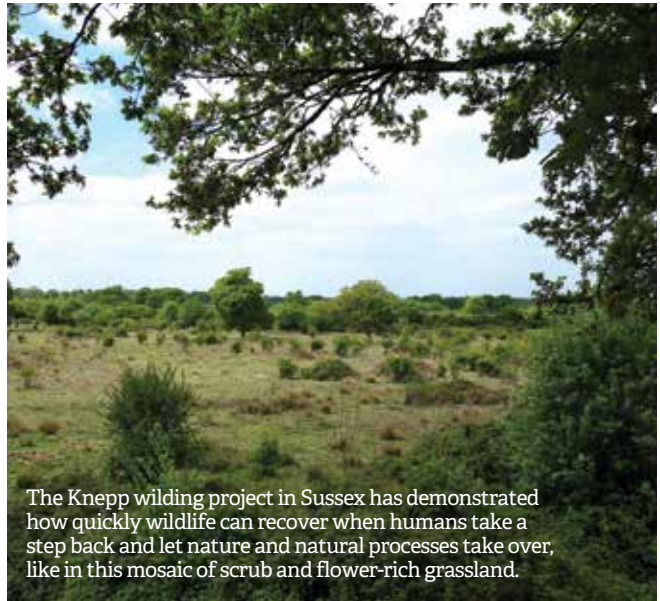
The Knepp wilding project in Sussex has demonstrated how quickly wildlife can recover when humans take a step back and let nature and natural processes take over, like in this mosaic of scrub and flower-rich grassland.

Find out more at https://knepp.co.uk/home or by reading Wilding by Isabella Tree.