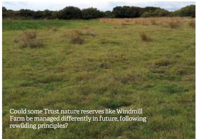
Could some Trust nature reserves like Windmill Farm be managed differently in future, following rewilding principles?